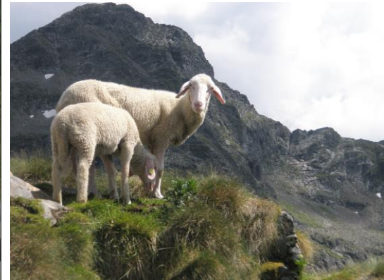
Pastoralism in Austria from AREC's point of view