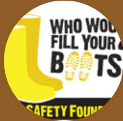
Farm Safety & Mental Health