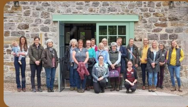
FAS Scotland, Women in Agriculture