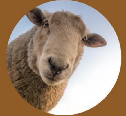
SCOTEID: Digital Records