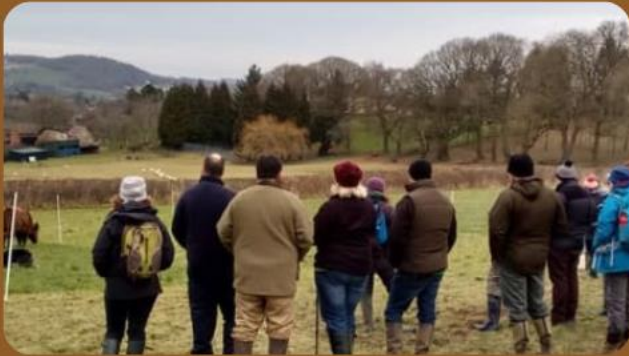
Training: Agroforestry, Conservation, Rare Breeds etc