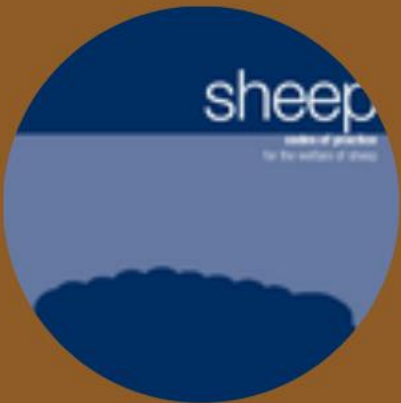
Sheep Welfare Code