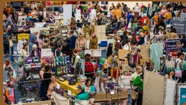
Scottish Yarn Festival